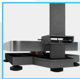
Load Cell Protection